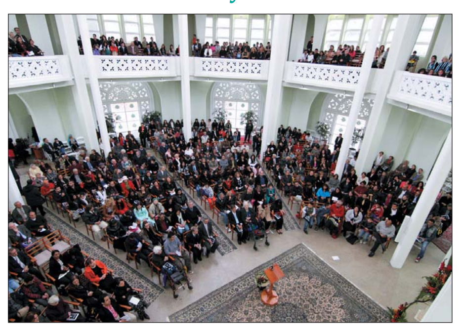
Temple at full capacity on final day of anniversary celebrations

Other events for children included storytelling, peace-building activities such as creating a "virtue" garden and making a